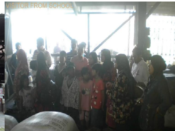
Visitors from school/charity society