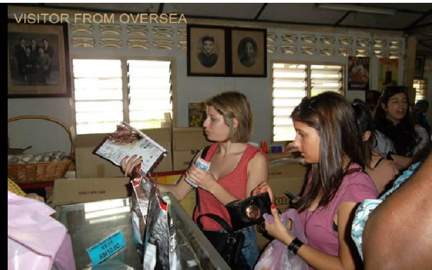
Visitors from overseas